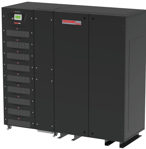
1100B with Maintenance Bypass