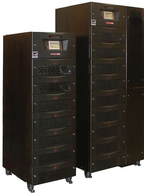
Ideal for IT closet applications.

The 1100 Series UPS from Mitsubishi Electric is a true on-line, double conversion single phase UPS that will protect your equipment from disruptions in power, such as brown-outs, line noise, voltage transients, and power outages.