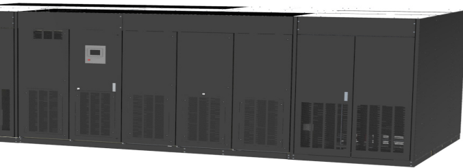
The 9900D is available in Black