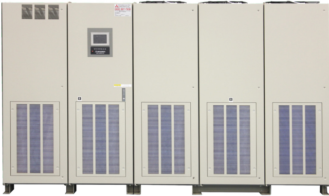
The 9900D can be Expanded in 400kVA Increments from 1200kVA to a Maximum of 2000kVA