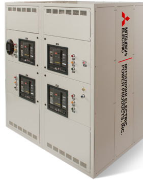
Optional Maintenance Bypass Cabinet